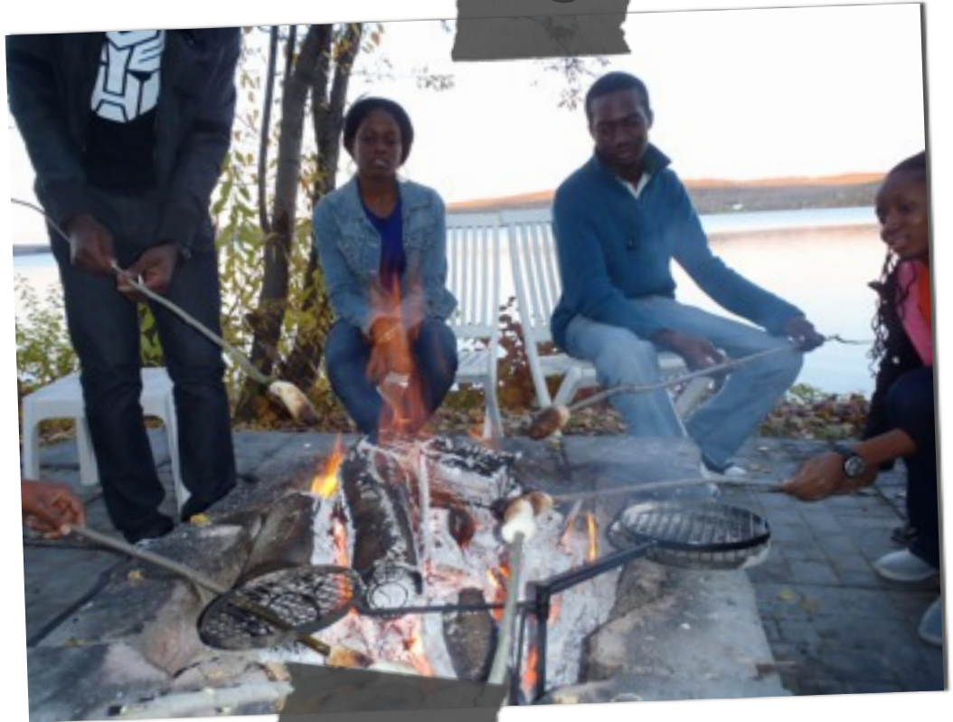
STUDENTS ENJOYING A CAMP FIRE AFTER RETURNING FROM A HIKE IN CHARLIE LAKE PROVINCIAL PARK.